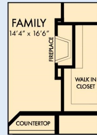
OPTIONAL WALL FIREPLACE AT FAMILY