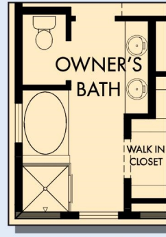
OPTIONAL SLIP IN TUB WITH SEPARATE SHOWER AT OWNER'S BATH