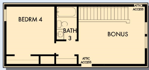
OPTIONAL SECOND FLOOR BONUS WITH BEDROOM 4 AND BATH 3

For additional options, please visit DavidWeekleyHomes.com