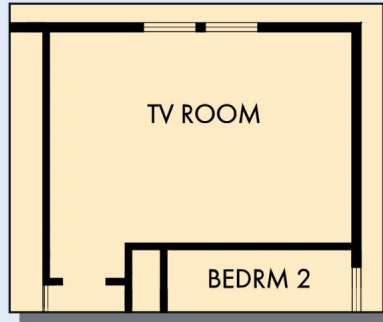
OPTIONAL TV ROOM AT RETREAT