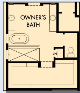
OPTIONAL FREE STANDING TUB AT OWNER'S BATH