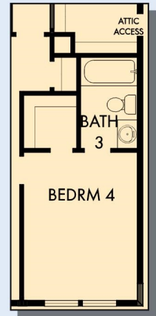
OPTIONAL BEDROOM 4 WITH BATH 3 AT RETREAT