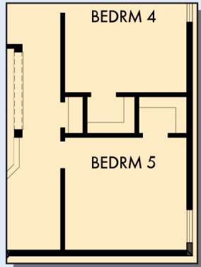
OPTIONAL BEDROOM 5 AT RETREAT