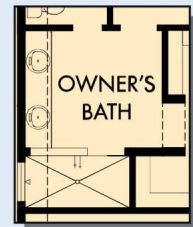
OPTIONAL WALK-IN SHOWER AT OWNER'S BATH