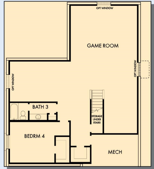
OPTIONAL GAME ROOM WITH BEDROOM 4 AND BATH 3 AT BASEMENT

For additional options, please visit DavidWeekleyHomes.com