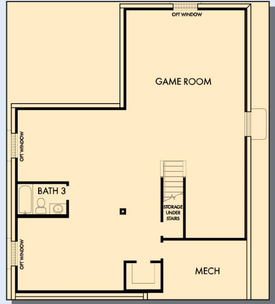
OPTIONAL GAME ROOM WITH BATH 3 AT BASEMENT