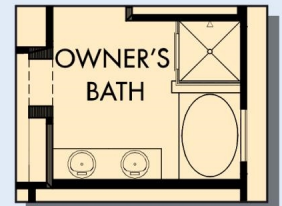
OPTIONAL SLIDE-IN TUB WITH SEPERATE SHOWER AT OWNER'S BATH