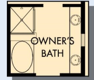
OPTIONAL SLIP-IN TUB WITH SEPARATE SHOWER AT OWNER'S BATH