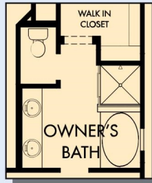
OPTIONAL SLIDE-IN TUB WITH SHOWER AT OWNER'S BATH